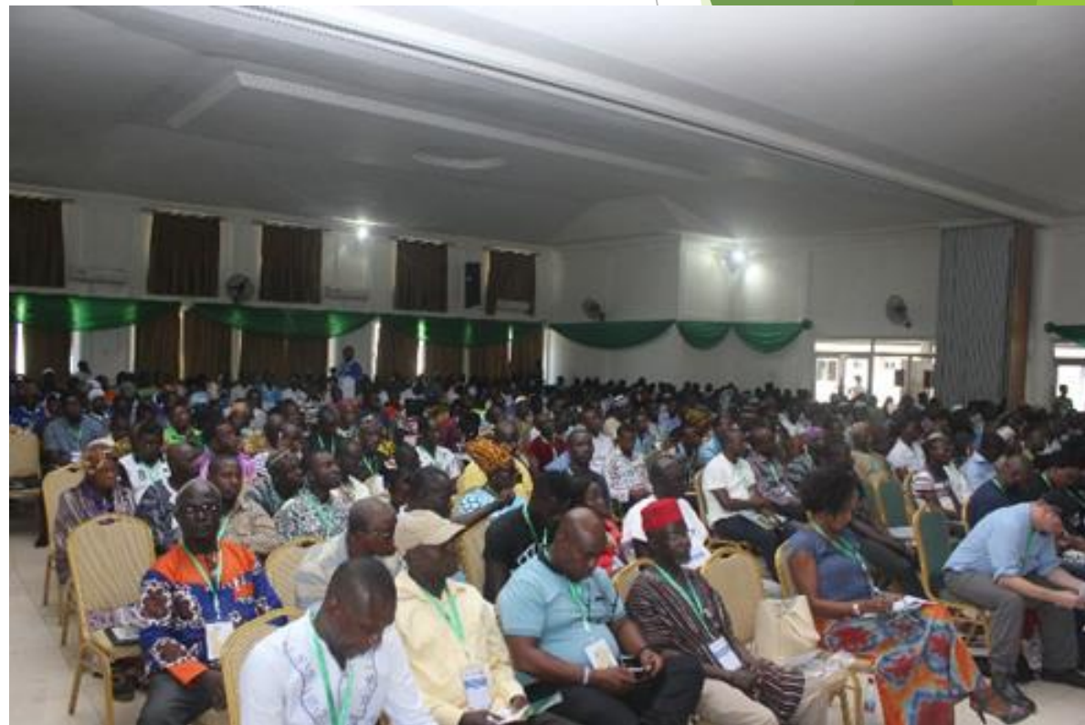
A section of the Participants at the Preseason Event