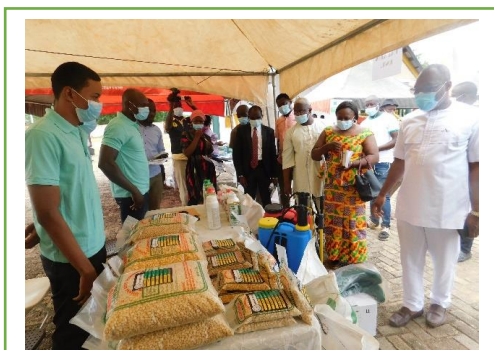
Fig 6: Municipal Chief Executive of Wa in the Upper West Region visiting some of the Exhibition stands at one of the seed fairs.

2.5 PROMOTION OF MEMBERS’ SEEDS THROUGH DISTRICT LEVEL SEED AND INPUT FAIRS: NASTAG through the support of the project and in collaboration with MoFA, AFAP and GIZ MOAP organized three district seed and input fairs in the Project’s Zone of Influence to promote the use of certified seeds in addition to other Crop Protection Products (CPPs), as optimum crop performance acts in consonance with choosing the right and quality CPPs at the right time, using the right application processes and procedures, in their right quantities. The Seed and Inputs Fairs took place in April and were held in the North East and Upper West Regions of Ghana per the details below.