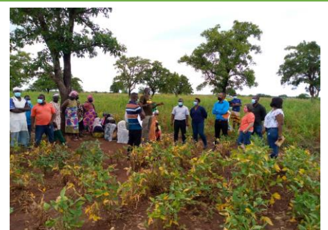
Fig 7: USAID Team Addressing farmers during a brown field day at Zoggu

The three events (Yagaba, Tumu and Wa) brought together a total of four hundred and eighty – three (483) with 23.6% being women) agricultural value chain actors as captured during registration of the participants as shown in the table; including farmers, seed producers, agro-inputs dealers, agribusiness players, and international development partner organizations and public institutions representatives from the Ministry of Agriculture and District / Municipal Assemblies. Cumulatively, 40 companies registered and exhibited their products at all three locations made up of seed companies, agro-input dealers and agro-input importers.