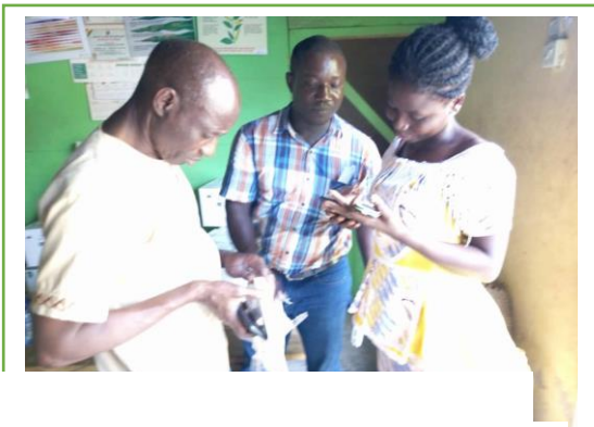
Fig. 11: Monitoring team sensitizing an input shop keeper on how to scratch and utilize the sticker

i) Expectation of the number of seeds labeled under the pilot programme was not met. Therefore, the rest of the stickers would be retrieved and kept safe for use in the second year of the project implementation.