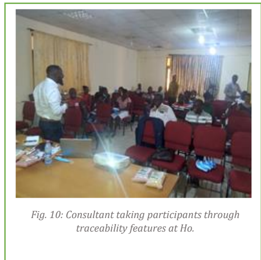
Fig. 10: Consultant taking participants through traceability features at Ho.

At the end of the planting window, a meeting was held on Wednesday, 18 th September, 2021 with IT consultant from mPedigree on the progress made so far in the implementation of the seed traceability system and the way forward. The analysis from the consultant showed that most stickers had not been scratched or used. In view of this, it was agreed that;