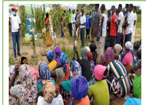
Fig 8: Project Manager interacting with farmers during green field day at Nyimeti.

2.6 FIELD DEMONSTRATIONS: As part of the USAID - GIAT Project implementation, thirteen (13) demos were earmarked and completed in the Project's Zone of Influence (Northern Zone), these activities were a collaboration with Rainbow Agrosciences (for CPPs) and Yara Ghana (for Fertilizers) per requests made to CropLife members. Thus, NASTAG members provided the respective improved seeds, Yara Ghana provided the Fertilizers and Rainbow AgroSciences provided the other crop protection products. Planting started on Tuesday, June 15, 2021. In addition to the planting field days, one radio discussion was held on Radford FM in Tumu to educate farmers on the advantages of using quality certified seeds, agro inputs and crop protection products. In September, 2021, the Green Field days were organized in collaboration with six seed companies namely; (Antika, Ariku, Heritage and SeedCo, Rainbow Agrosciences and YARA Ghana) to afford farmers the opportunity to have physical evidence of the effect of using certified seeds, quality agro inputs and crop protection products and GAPS on their various fields. A total of six hundred and forty – four (644) people actively participated in the green field days in all ten (10) demo sites. The Brown Field Days was held in November, 2021 purposely for harvesting on the various demonstration fields.