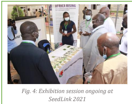
Fig. 4: Exhibition session ongoing at SeedLink 2021

The National Seed Trade Association of Ghana (NASTAG) in collaboration with the Secretariat of the National Seed Council (NSC) under the auspices of the Ministry of Food and Agriculture (MoFA) organized the 2nd Ghana Seed Business and Networking Forum dubbed “SEEDLINK 2021” . The event took place on November 3 – 4, 2021 at Tomreik Hotel, East Legon, Greater Accra Region under the theme: “Enhancing the Utilization of Quality Seed by Every farmer” .