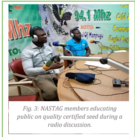
Fig. 3: NASTAG members educating public on quality certified seed during a radio discussion.

2.2 RADIO SENSITIZATION: Promotion for the use of quality and certified seed and access to approved crop protection materials is an annual mandate of NASTAG. In 2021, a total of Twenty- Seven (27) NASTAG and SeedPAG members were selected to champion this course via radio discussions, these discussions were carried out in eighteen (18) selected radio stations in eight (8) regions from March to May. This year’s theme was dubbed “BUY THE RIGHT SEED” . During the show, listeners were allowed to phone in and ask questions, express their views and seek clarifications concerning seeds and related crop protection products. The programme received massive endorsement from various stakeholders, and many have called for its continuation, but this can only be done subject to funds.