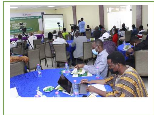
Fig. 5: Participants at SeedLink 2021

It also created opportunity for agriculture stakeholders to make inputs into the government’s agriculture-related policies and programmes on local seed production, agribusinesses development, agriculture technologies adoption and good agronomic practices among others. The participants contributed their views and opinions into proposing a national strategy for effective and efficient seed marketing and distribution, got updated on pertinent seed sector issues, developed their businesses through exhibitions a marketing relationships. The forum offered an opportunity for companies and service providers to showcase their products and market their brands as participants. It also allowed companies/organizations to project their activities through an exhibition with extensive media coverage to improve their corporate image and brand name.