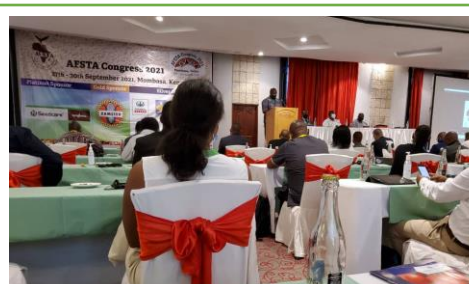
Fig. 1: AFTSA 2021 congress ongoing in Mombasa, Kenya

operate and learn some of the activities they undertake to sustain the seed sector.